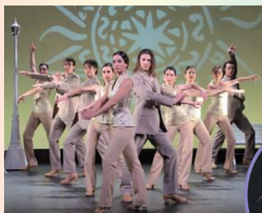
PARQUE ESPAÑA PARADE ESPAÑA CARNIVAL

The shows are subject to cancellation due to seasonal changes in climate or inclement weather.